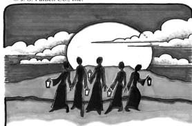
Five wise virgins brought oil for their lamps