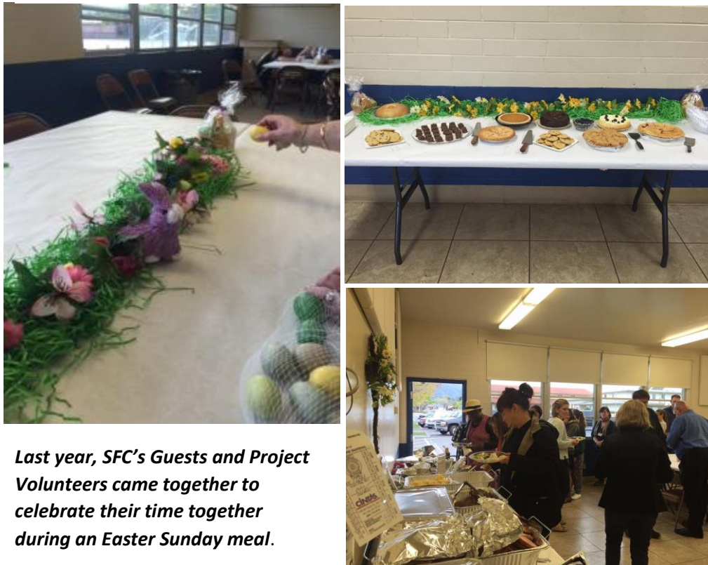
Last year, SFC's Guests and Project Volunteers came together to celebrate their time together during an Easter Sunday meal.

For more information and to track the progress of the 2017 campaign, visit the parish Website at http://sfcabrini.org/ or follow the program on Facebook at https://www.facebook.com/sfcsjca/ .